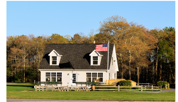
Falmouth Airpark Community Building

Buy a custom home or build a house of your dreams with your own private hangar. There are beautiful wooded home sites with grass taxiways leading to a paved and lighted 40' x 2,300' runway. Additionally, non-hangar properties, two-bedroom condominiums, hangars, and tie downs are available. Your home will be part of an established, private community with over 50 acres of undisturbed woodlands. At Falmouth Airpark, roads and taxiways, which are edged by split rail fences, are beautifully manicured. All utilities are underground and properties are professionally landscaped.