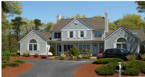
Condominium at Falmouth Airpark