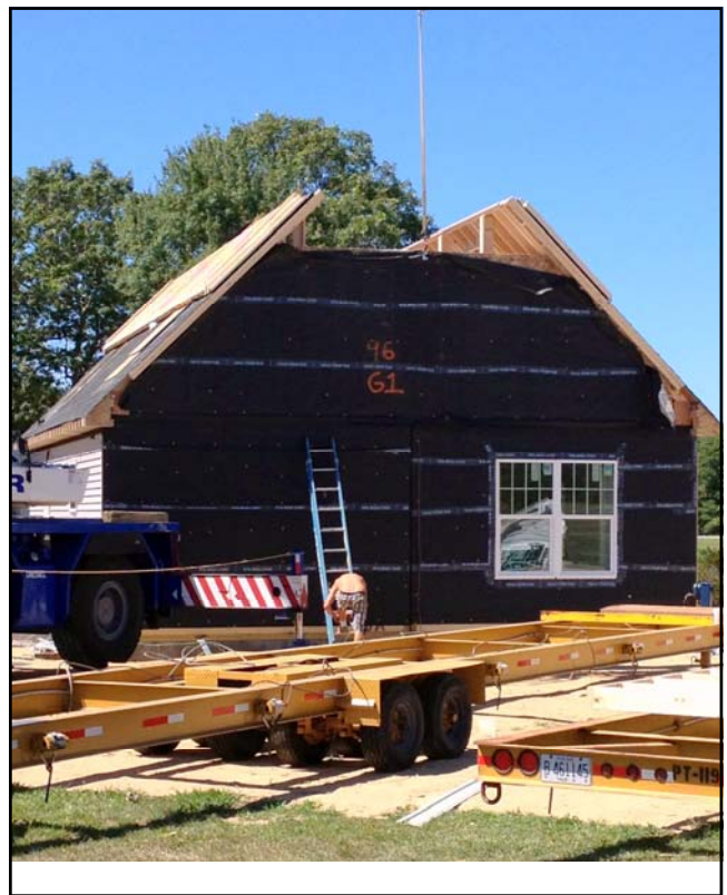
Building Being Assembled