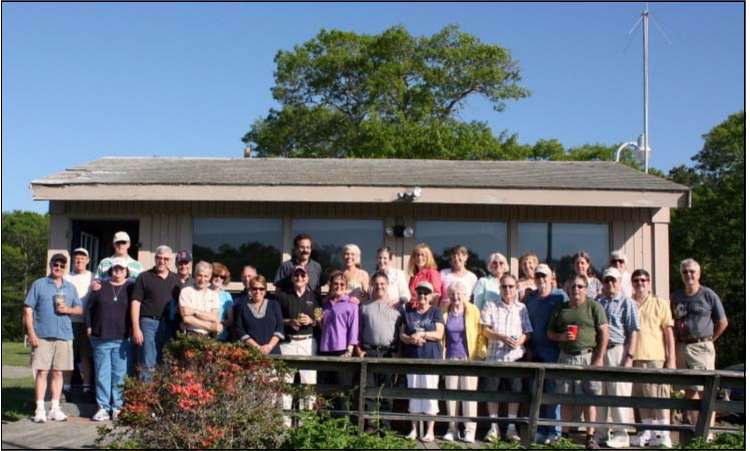
The Last Donut