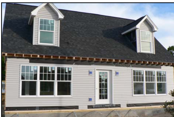
Building Assembled (Front) 8-15-13